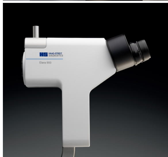
OPTIMIZED VIEWING ANGLE & SMOOTHER POSITIONING

Elara 900's motorized height adjustment reduces repeated lifting movements that can strain the wrist and forearm, allowing for smoother and controlled positioning with minimal manual force. Together, Elara 900 reduces strain and supports long term comfort.