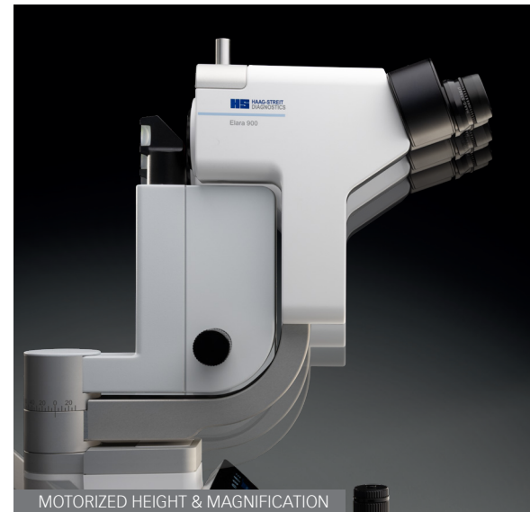
MOTORIZED HEIGHT & MAGNIFICATION

Additionally, Elara 900's motorized magnification changer enables seamless magnification adjustments directly from the joystick, delivering an uninterrupted diagnostic experience.