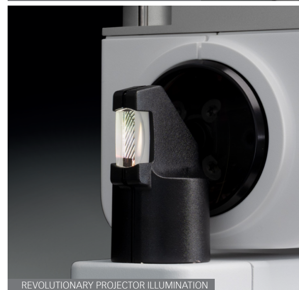
REVOLUTIONARY PROJECTOR ILLUMINATION

Elara 900's revolutionary projector light source ("P-Type") can emit colors across the entire visible spectrum, allowing different color temperatures to be selected for individual pathologies. Offering more illumination modes than traditional LED or halogen sources, the result is a high-resolution, high-contrast examination that aids in the identification of ocular structures. Infrared* illumination enables seamless Meibomian gland assessment, further boosting your workflow.