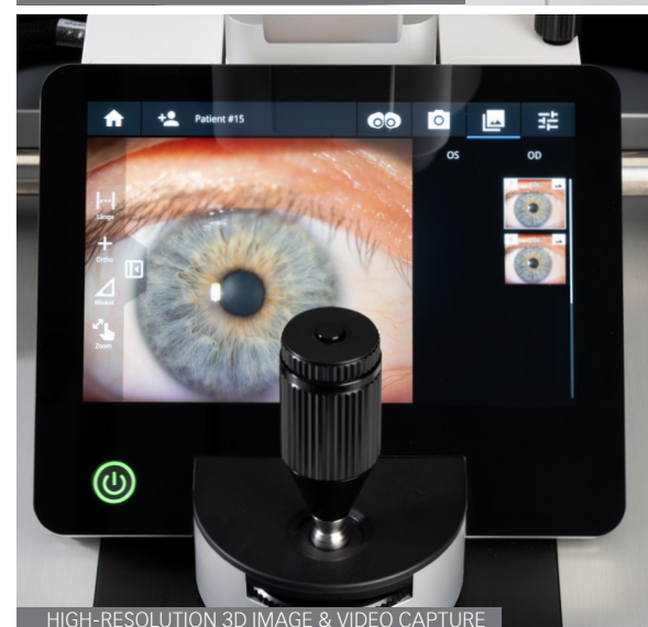
HIGH-RESOLUTION 3D IMAGE & VIDEO CAPTURE

Stereoscopic visualization enhances ophthalmic education, allowing colleagues and students to experience examinations with exceptional depth and clarity.