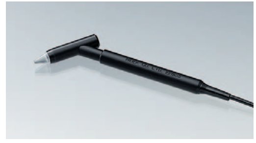
45° Fixed probe*

The pachymetry mode offers precise measurement of the corneal thickness within a \pm 5~\mu m error. (A model without pachymetry is also available.)