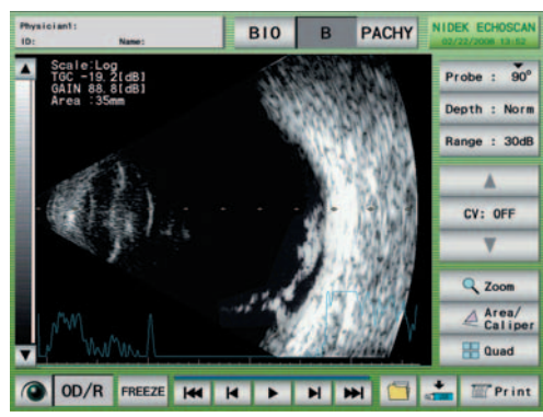
Cross vector mode