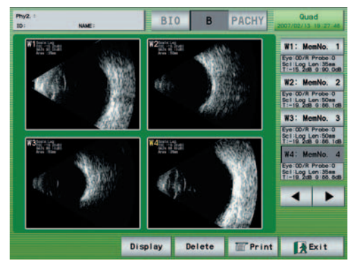
Multi image display function

The results are high quality images, which are essential for accurate analysis. The key to achieving high quality images is through scanning 400 lines over 60° which is displayed on a 1,024 x 768 XGA monitor. High contrast of resonated signals and the high quality LCD monitor provide the ideal images for the most accurate diagnosis.